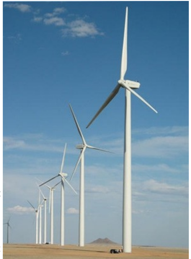
1.5 Megawatt General Electric wind turbines