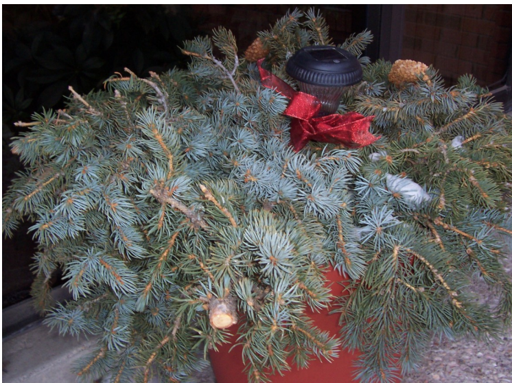
One of the many decorated flower pots in downtown Wheatland

Businesses had been working on this lighting project since before Thanksgiving, keeping things "under cover" until the night of Friday, December 4. At 5:30 that evening, floats were assembled at the Wheatland Co-op, and at 6:00 they began the trip up South Street and along 9th Street to the intersection on Gilchrist where Derek Barton described each float as it came by. Santa then did a countdown which was broadcast on KYCN/KZEW radio, and at "Zero!" the Christmas lights all over the historic (See p. 6)