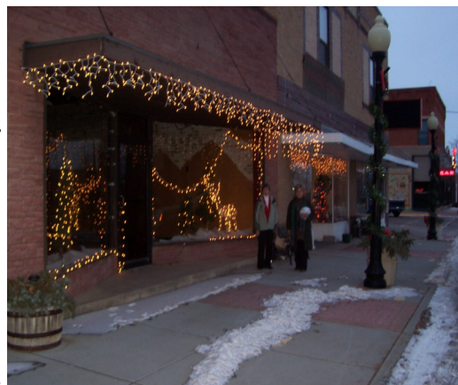
One of many decorated downtown businesses

Hats off to the many volunteers, downtown merchants and building owners, and parade participants who made this festival possible.